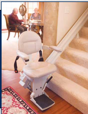
ELECTRA-RIDE™ ELITE Model SRE-2010

Home accessibility solutions and automotive products