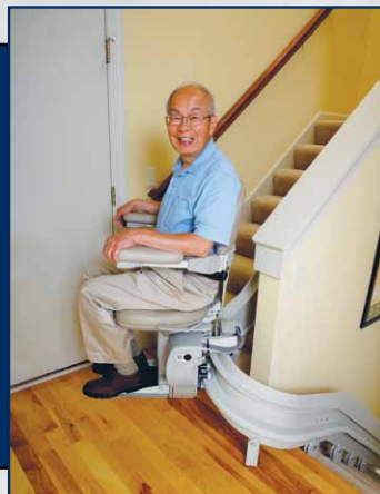
ELECTRA-RIDE™ III Model CRE-2110