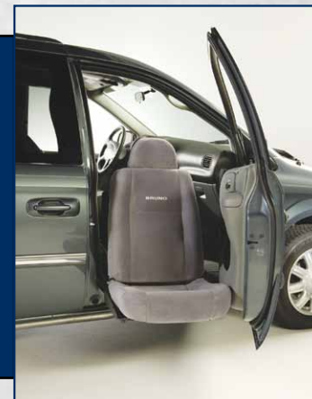
TURNING AUTOMOTIVE SEATING™ (TAS™)